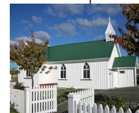
Holy Trinity 24 Wainui Rd Silverdale