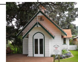
Christ Church 56 Waiwera Rd Waiwera