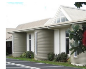
St Chad's 117 Centreway Rd Orewa